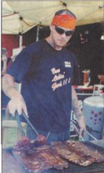
If Ribs are your thing, then get ready. The Strongsville City Club Rib Burnoff is back for its 27th year on the Commons.

Proceeds from the event are funneled back to a number of Strongsville City Club initiatives including Special Olympics. Visit www.strongsvilleyclub.org/Rib_Burnoff/General_Info for coupons and more information.